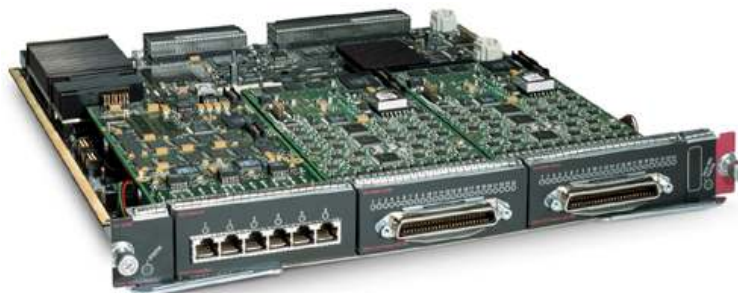
Figure 1. Cisco Communication Media Module

The Cisco CMM is a modular line card that supports four different types of port adapters, including 6-port T1, 6-port E1, 24-port foreign exchange station (FXS), and 128-port conferencing and transcoding port adapters. Up to four port adapters can be installed in a single Cisco CMM Line Card. Customers have the flexibility of mixing any of the four types of port adapters in a single Cisco CMM (Note: Mixed E1 and T1 port adapters on the same CMM are not allowed).