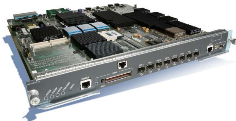
Figure 2. Supervisor Engine 32 PISA with 2-Port 10 Gigabit Ethernet and PFC3B