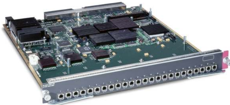
Figure 3. CEF256-Based 100BASE-FX Fiber Interface Module (part number WS-X6524-100FX-MM)