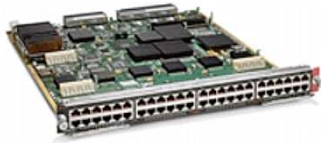
Figure 5. Cisco Classic 48-Port 10/100/1000 Module (part number WS-X6148E-GE-45AT) with 802.3af PoE and 802.3at PoE+