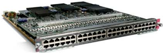
Figure 8. Cisco Classic 48-Port 10/100 802.3af PoE Module (part number WS-X6148A-45AF)