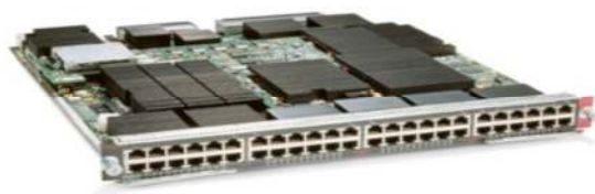
Figure 1. Cisco Express Forwarding 720 10/100/1000 Interface Module (part number WS-X6748-GE-TX) with Distributed Cisco Express Forwarding Daughter Card (part number WS-F6700-DFC3)

1 Queues Legend: 1p3q1t = 1 priority queue, 3 round robin queues, 1 threshold