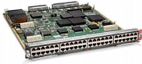
Figure 3. Cisco Express Forwarding 256 Copper 10/100 Interface Module (part number WS-X6548-RJ-45)