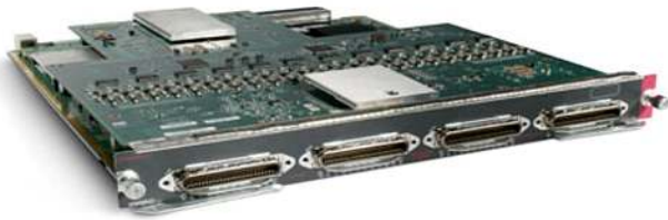
Figure 10. Cisco Classic 96-Port 10/100 (with field upgrade option to 802.3af PoE module) (part number WS-X6196-RJ-21)