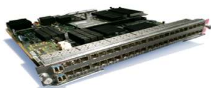
48 Port SFP-Based Module