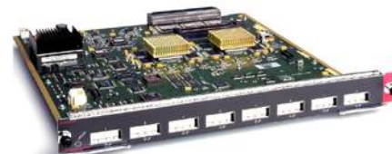
8 Port GBIC-Based Module

Designed to complement the many roles that the Cisco Catalyst 6500 Series plays in a network, Cisco Catalyst 6500 Series mixed media Gigabit Ethernet modules offer the broadest selection of media, densities, performance, interoperability, and chassis deployments for enterprises and service providers. These modules are ideal for gigabit Ethernet over fiber to the desktop, gigabit uplinks, aggregation of high-density 10/100 interfaces, Metro Ethernet, backbone and high-speed server farm or data center connections as well as mixed media environments supporting both fiber and copper cable connections. The Cisco Catalyst 6500 Series Gigabit Ethernet modules offer: