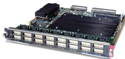
16 Port GBIC-Based Module