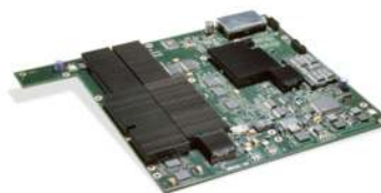
Optional field-upgradeable Distributed Forwarding Card (DFC)