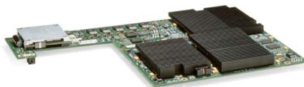
Figure 4. The Optional Field-Upgradeable for use with CEF720 Class Interface Modules

** Queues Legend: 1p3q1t = 1 priority queue, 3 round robin queues, 1 threshold. For optimal performance, Cisco recommends using a distributed forwarding card