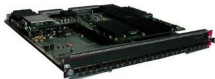
24 Port SFP-Based Module