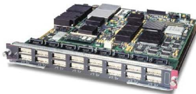
Figure 5. dCEF256 Gigabit Ethernet Optical Interface Modules WS-X6816-GBIC