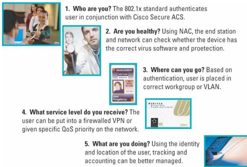
Figure 3 Trust and Identity System

Working together, the components of the trust and identity system provide the foundation for network access and policy control in the network. Figure 3 shows how the different steps in a trust and identity system work together.