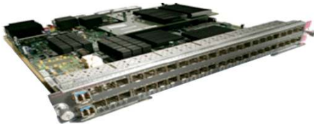
Figure 5. 6800 Series 48-Port 10/100/1000 Interface Copper Module WS-X6848-TX-2T/2TXL