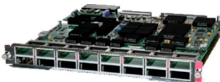
Figure 1. 6800 Series 16-Port 10 Gigabit Ethernet Fiber Module

The 6800 Series 16-port 10 Gigabit Ethernet Fiber module (Figure 1) provides up to 176 10 Gigabit Ethernet Fiber ports in a single Cisco Catalyst 6513-E Switch chassis, 352 10 Gigabit Ethernet Fiber ports in a Cisco Catalyst 6500 Virtual Switching System (VSS) 2T.