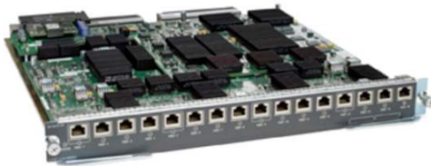
Figure 2. 6800 Series 16-Port 10 Gigabit Ethernet Copper Module

The 6800 Series 16-port 10 Gigabit Ethernet Copper module (Figure 1) provides up to 176 10 Gigabit Ethernet Copper ports in a single Cisco Catalyst 6513-E Switch chassis, 352 10 Gigabit Ethernet Copper ports in a Cisco Catalyst 6500 Virtual Switching System (VSS) 2T and is primarily designed for data center access with a secondary use case for switch-to-switch connectivity.